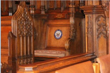
Seventh-day Adventist Barry Black, Chaplain of the United States Senate, has his very own seat in the cathedral.