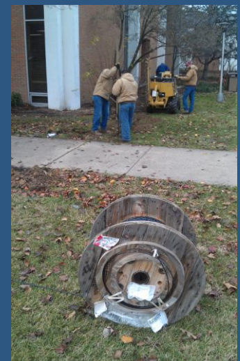
Shentel workers lay fiber-optic cable for a vastly improved internet service.

We will be working with Shentel to tune our use of the new fiber line and making sure we are running smoothly before disconnecting our other services. We're looking forward to a better internet experience in January!