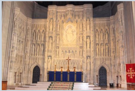
The main altar in the cathedral.