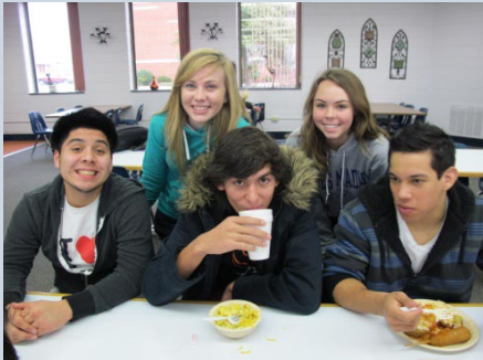
Loading up on lunch before the trip to Andrews University.