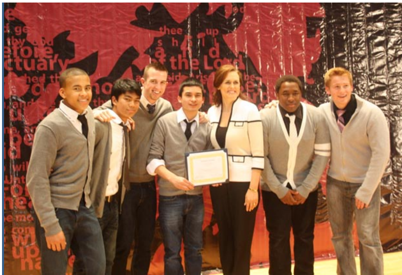
"INSPIRATION" wins first place at Youthfest.