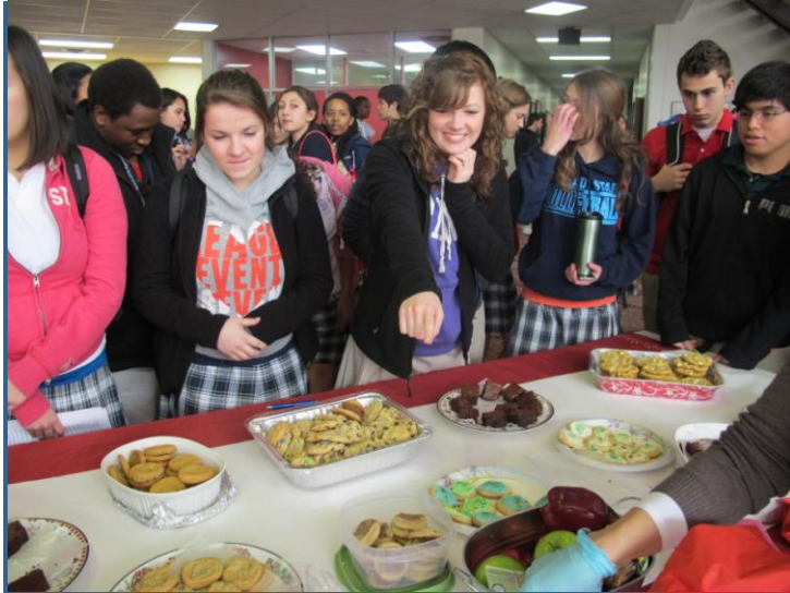
Students crowd in the foyer on Monday to get their cookies.