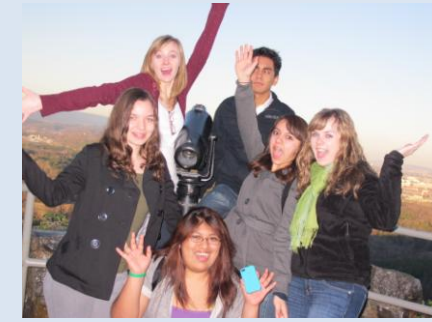
On top the world! "View Southern" attendees take a trip to the top of Ruby Falls.